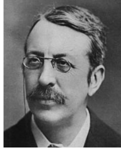
Sir Charles Villiers Stanford