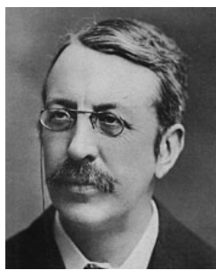
Sir Charles Villiers Stanford